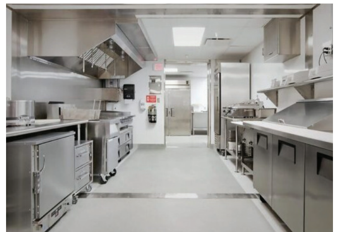
Interior of kitchen facility from Kitchens To Go