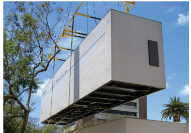
Example of modular kitchen facility from Kitchens To Go being installed at a school in Marin County