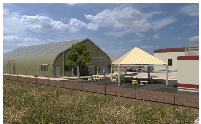
Site rendering shown of patio area with an almond, cranberry and gray color scheme.

Site Renderings of color options have been updated for public review. Upcoming social media posts will contain information about public participation in the color selection process.