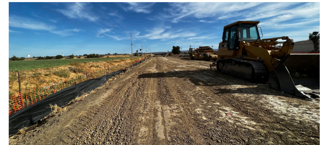
Groundwork Completed for Site Preparation Construction