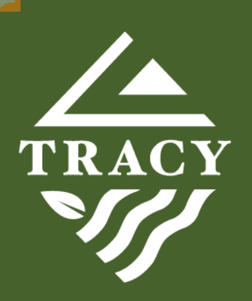
Think Inside the Triangle<sup>11</sup>