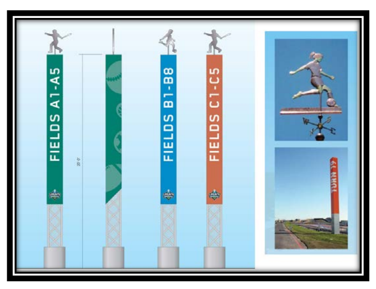
Field Identification Markers