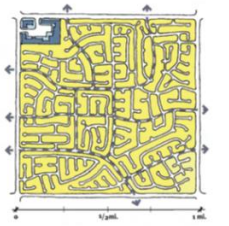
Cul-de-Sac Only - Discouraged