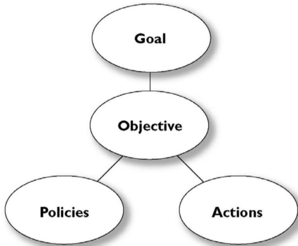
FIGURE I-3 GENERAL PLAN COMPONENTS