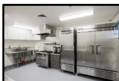
Spacious Kitchen Plastic Chairs