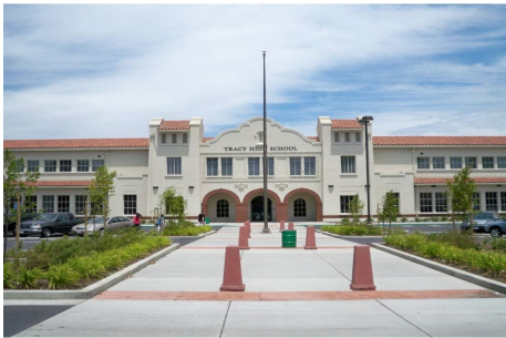
Tracy High School

Measure E is a $51 million dollar bond measure, approved by voters on June 6, 2006. Measure E authorized funding for needed repairs, upgrades and new construction projects to Tracy High School and the completion of sports facilities and a theatrical facility at West High School. Through careful planning and hard work, TUSD has secured an additional $36.2 million in state matching contributions. In total, Measure E has been supplemented by $42 million of matching funds, from non-local sources, including the State of California, to generate $93 million in projects.