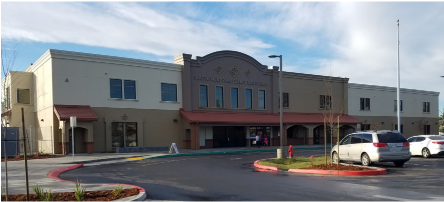
South/West Park School

Measure S was used to renovate the Monte Vista Middle School campus, the McKinley School campus and the South/West Park school site. Measure S was also utilized for planning on the Clover School campus (home of the Tracy Learning Center Charter Schools) and the Central School campus. In addition to these school sites, Measure S funded technology upgrades including data and cabling, wireless infrastructure and network security improvements for all schools. All Tracy schools now have state of the art surveillance systems which improves campus supervision, safety and deters vandalism.