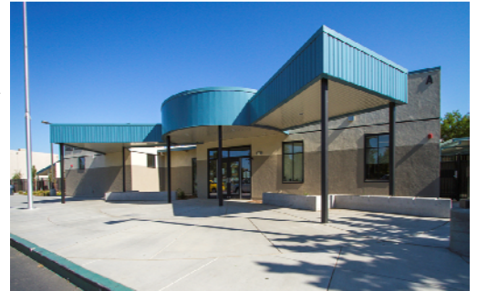
Monte Vista Administration Building

Measure S was used to renovate the Monte Vista Middle School campus, the McKinley School campus and will be used to modernize the South West Park school site. In addition to these school sites, Measure S funded technology upgrades including data and cabling, wireless infrastructure and network security improvements for all schools. All Tracy schools now have state of the art surveillance systems which improves campus supervision, safety and deters vandalism.