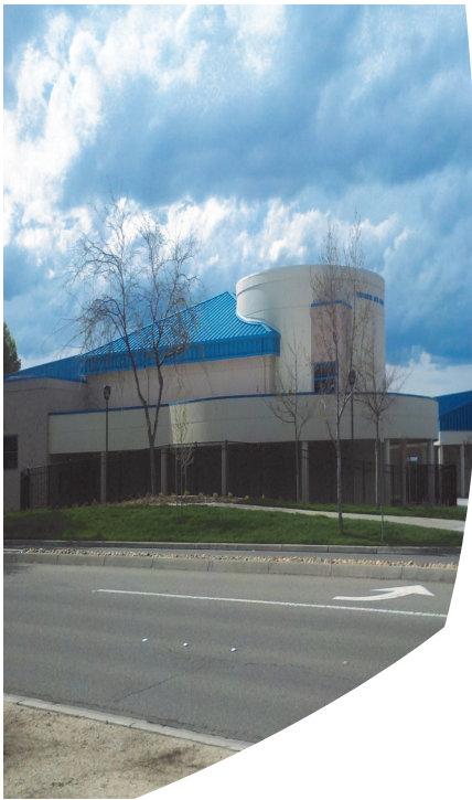
West High School Performing Arts Center