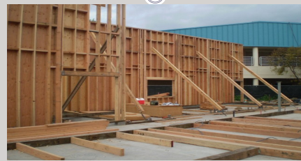
West High School Performing Arts