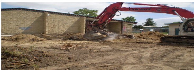
Summer Demolition — School Frontage