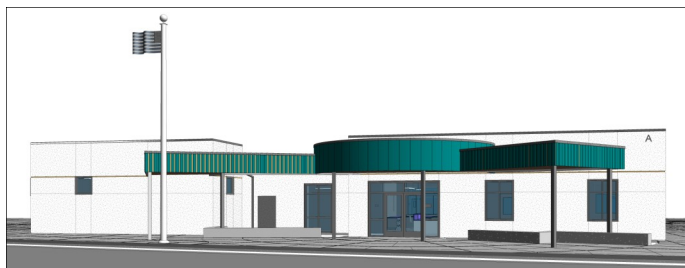
Improved Campus Rendering