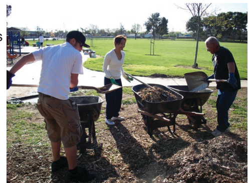
Give-A-Day. Get A Disney Day. Clean-Up volunteers

Bland, Kenner and Hoyt Parks. City Departments, Parks and Community Services in partnership with Public Works coordinated the effort and assisted by donating supplies like rakes, shovels, garbage bags and pruners. Volunteers raked tan bark and sand, picked up leaves and garbage, pruned and trimmed landscaping, dug out weeds, and