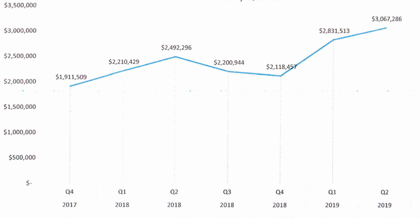
Measure V: Revenue by Quarter