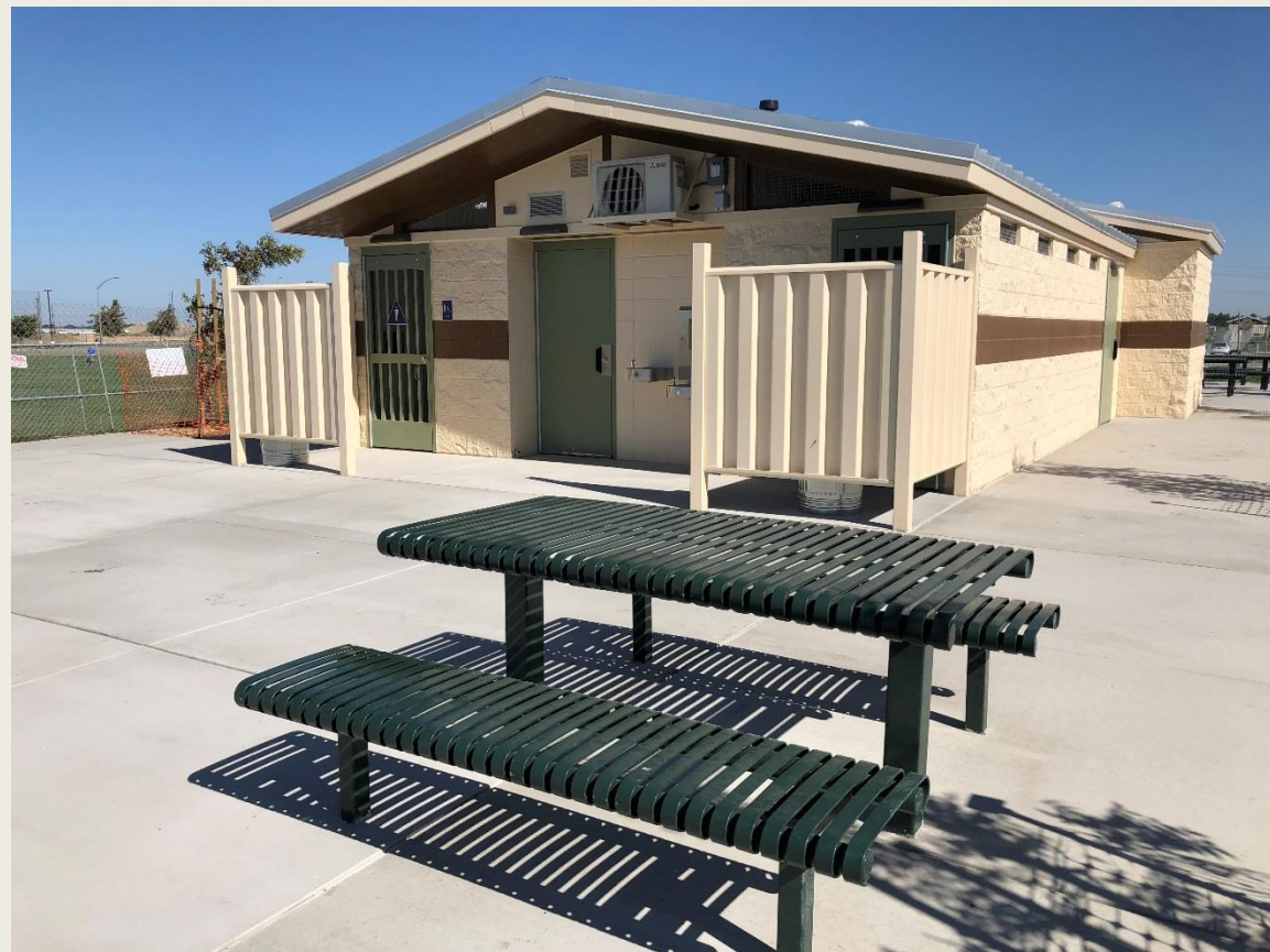
New Plaza Spaces with Seating and Shade