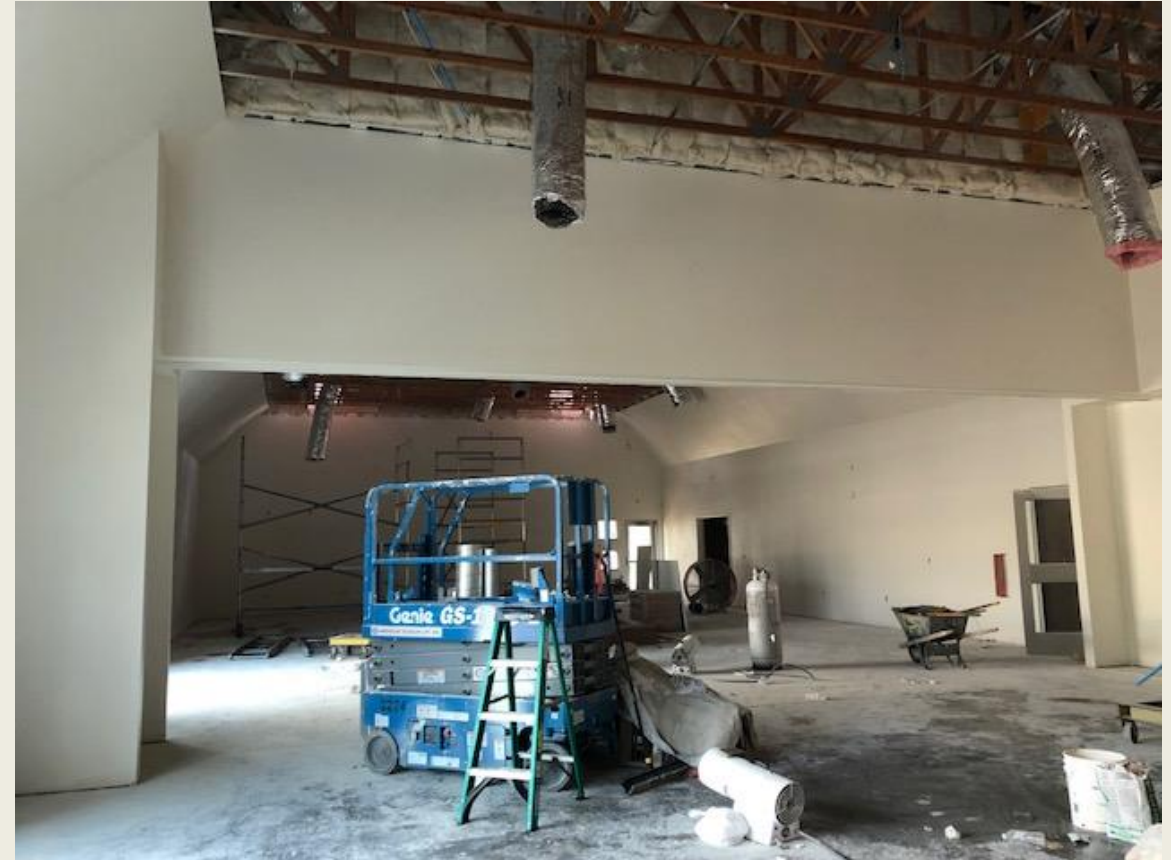
View of New **EXPANDED** Multi-Purpose Room