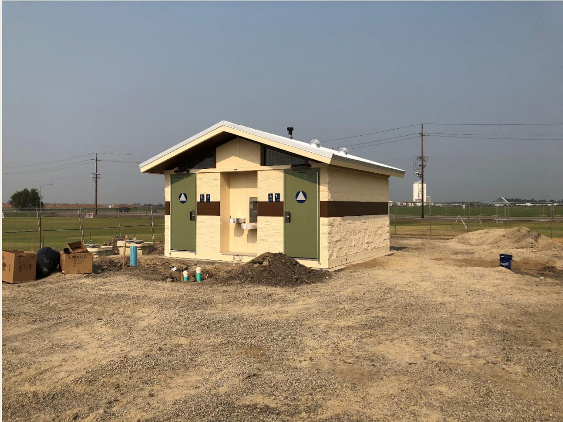
New Restroom/Concession Buildings Installed