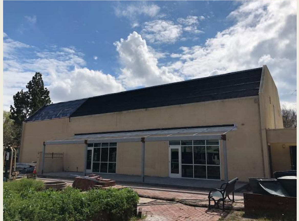
Views of North and East Side of Building